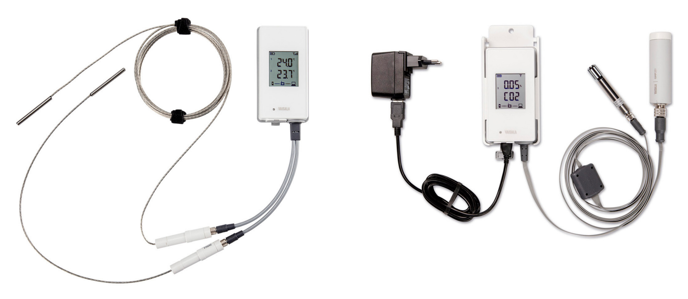
RFL100 with two TMP115probes (left) and with GMP251and HMP110probes (right)